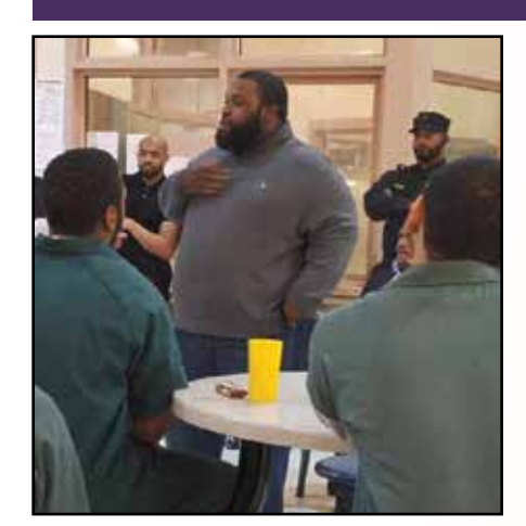
In mid-January, I visited a Philadelphia County prison to speak to juvenile inmates about being ready to make the most of their second chance once they're released.