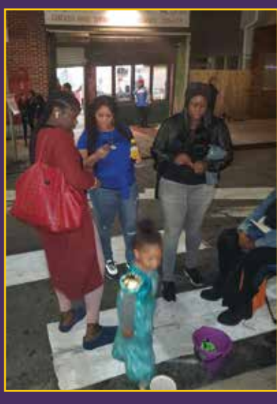
Each year, I love hosting my Trunk or Treat event to give neighbors and children a safe, fun Halloween experience outside my district office.