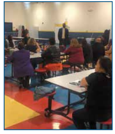
Last fall, we held a Cost of College event at Prep Charter High School to help local students and their parents understand the choices and options that go into paying for higher education.